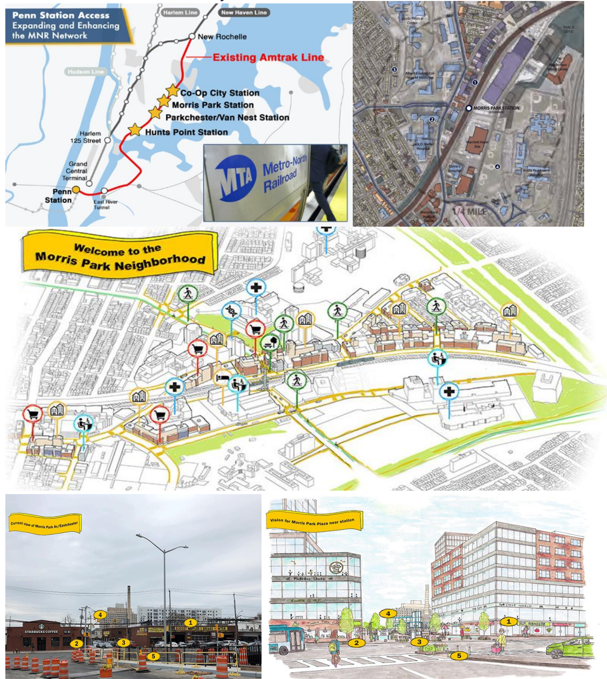
Current view of Morris Park Ave/Eastchester Rd. (left) Vision of Morris Park Plaza near the Metro North station that will be located on Bassett Ave (right).

The MPBID continued monitoring and participated in events presenting city agencies' work around providing Metro North access to Penn Station at the east end of Morris Park Avenue, using an existing Amtrak line. This project will include a "Morris Park Avenue" station to be located on Bassett Street, at the very eastern end on Morris Park Avenue.