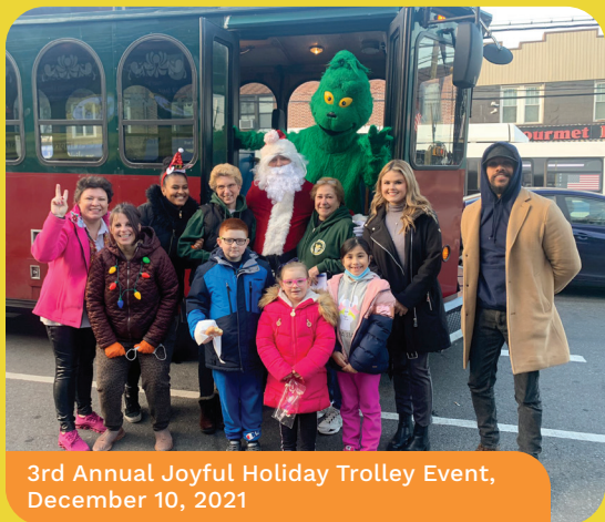
3rd Annual Joyful Holiday Trolley Event, December 10, 2021