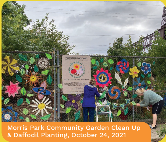
Morris Park Community Garden Clean Up & Daffodil Planting, October 24, 2021