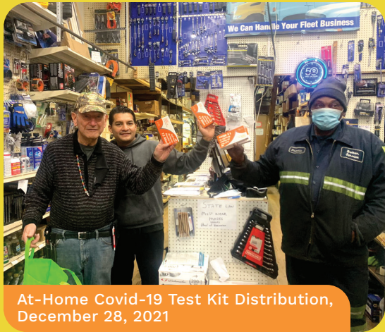
At-Home Covid-19 Test Kit Distribution, December 28, 2021